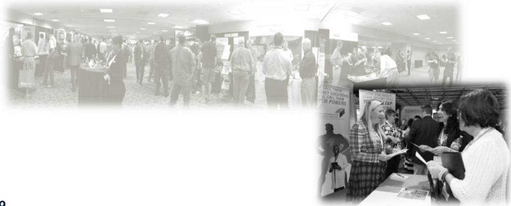
Exhibit Space Rates